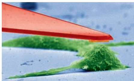
Composite image of an AFM tip (orange) holding uric acid above an APC (green).

Antigen-presenting cells (APCs) recognize foreign molecules—for instance, the lipopolysaccharides produced by microbial invaders—that bind to cell surface receptors, which mobilize intracellular signal transduction pathways and initiate an anti-microbial response. APCs can also be activated by environmental factors such as the uric acid crystals that are associated with gout. Whether these sorts of particulate materials engage APCs by a similar receptor-based mechanism has been unclear.